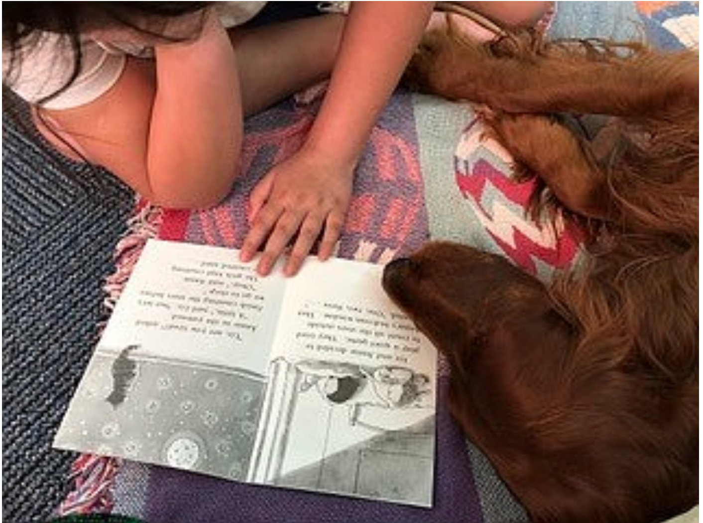
Shown is a student reading to a therapy dog in the Pet Partners of Prescott program in the Prescott Unified School District Elementary schools.

Working with the social workers has been invaluable. To see a child come to the social worker crying because of a situation they are experiencing in their life and see the dog crawl into their lap is amazing. The child calms and is able to talk about his or her feelings more freely. Many people experience this calmness, this feeling of relief when petting their own pet.